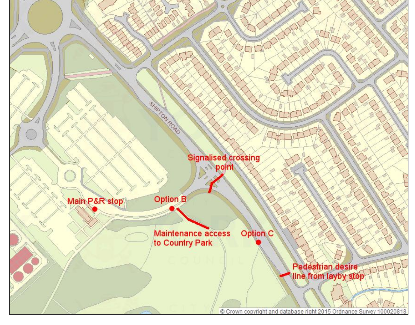
Figure 2: Map showing locations of options B and C.